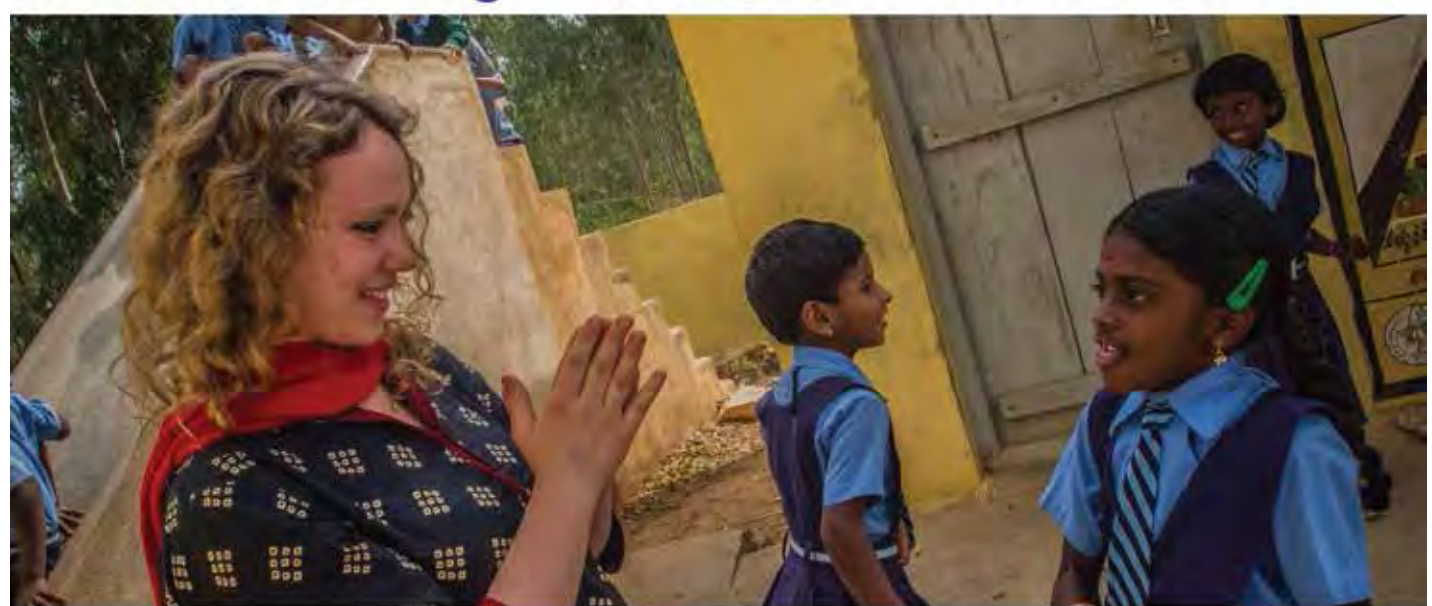
Discover where you'll study abroad at usac.unr.edu